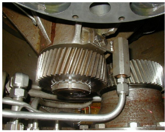
Auxiliary Drive (Partial Image)

Unit A, following extensive repairs to the whole Power Turbine thrust bearing assembly, was made available. Unit B gearbox was then repaired and returned to service.